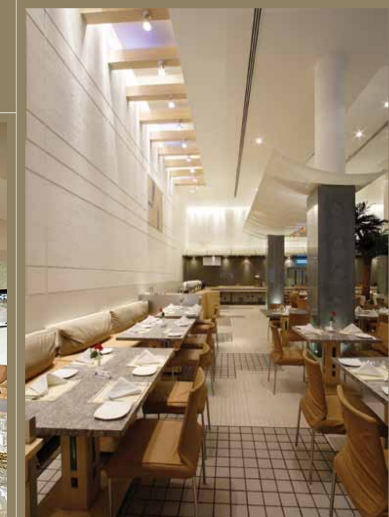
The palm tress and the large windows enhance the mood of the courtyard café