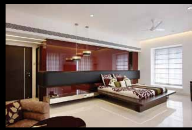
Natural materials used give a bold & solid look to the minimal design.